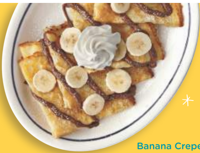
Banana Crepes with Nutella®