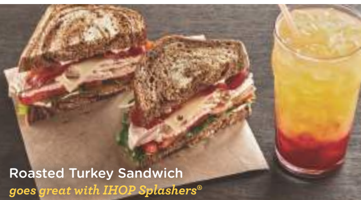
Roasted Turkey Sandwich goes great with IHOP Splashers®

Hamburguesa con Queso 7.79 Available without cheese. 7.59