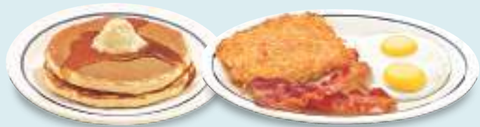
Pancake Combo 8.99 Choice of any 2 same-flavored pancakes.

PICK YOUR PANCAKES + 2 EGGS* YOUR WAY + 2 BACON OR 2 SAUSAGE + HASH BROWNS