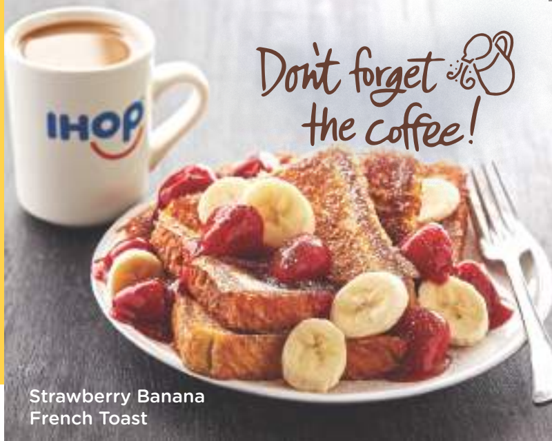
Strawberry Banana French Toast