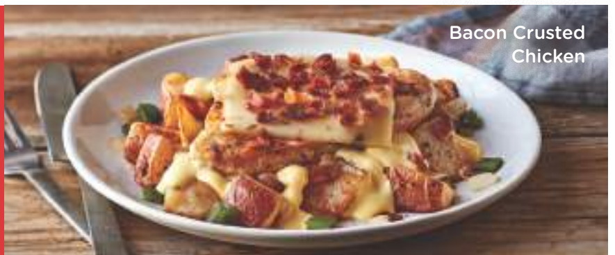
Bacon Crusted Chicken

All entrées are served with choice of one: Soup Side Salad