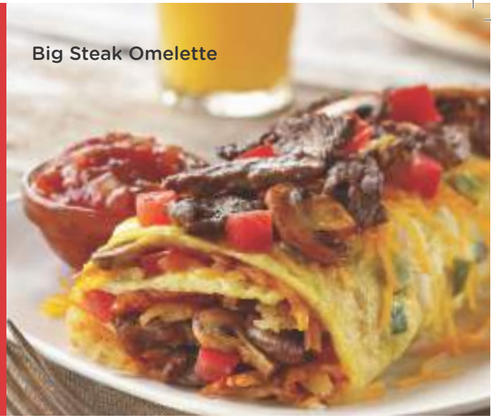
Big Steak Omelette

Omelettes include † your choice of one side: